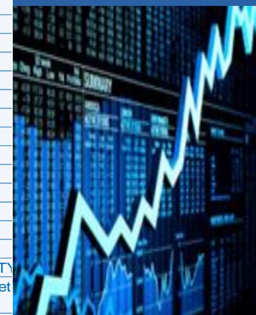
NIGERIA ALL-SHARE INDEX (ASI) TREND